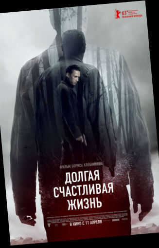
Oct 29, 2014 Long Happy Life [Dolgaia shchastlivaia zhizn'] (Khlebnikov, 2013)