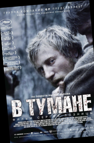
Oct 8, 2014 In the Fog [V tumane] (Loznitsa, 2012)