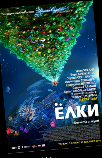
Nov 19, 2014 Six Degrees of Celebration [Elki] (Bekmambetov, 2010)

Five short stories about contemporary life in Russia.