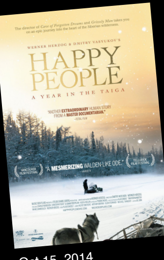
Oct 15, 2014 Happy People: A Year in the Taiga (Herzog, 2011)